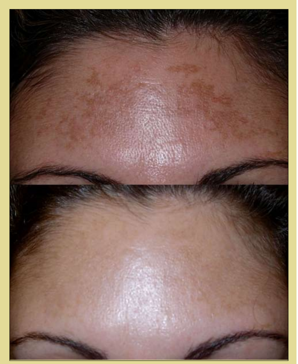
Patient after three treatments with fractionated resurfacing laser for melasma

According to the latest studies, The latest treatment is fractional approximately 30 minutes. This with melasma.